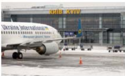
Kiev International Airport, Ukraine