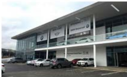
BMW Menlyn Auto, South Africa