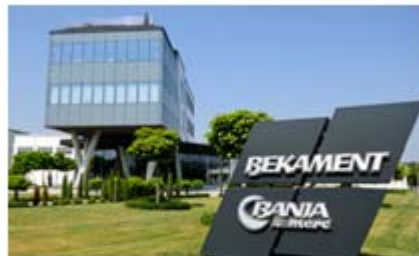
Serbia Factory Bekament